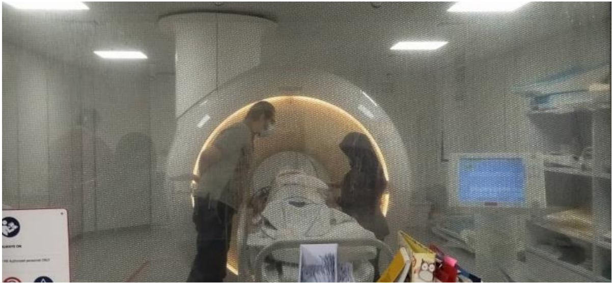
Figure 1: Thrombolysis in MR suite.